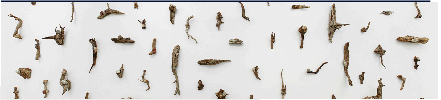
Bronwyn Katz: 'Khalläeb (Flowering season)'; 2024; Greywacke, sandstone, slate, copper, river stone, jasper, rose quartz, blue gum, pine, black wattle; 319 x 953 x 33cm; © Bronwyn Katz; Courtesy of the artist and Stevenson, Cape Town, Johannesburg and Amsterdam; Photograph by Nina Lieska