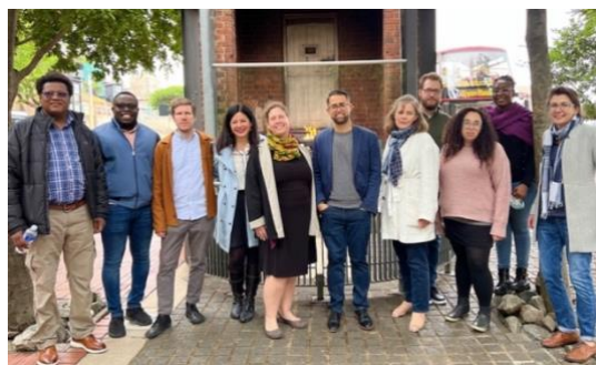
Epistemic Wrongs and Epistemic Reparations Workshop Speakers at the Flame of Democracy , Constitution Hill